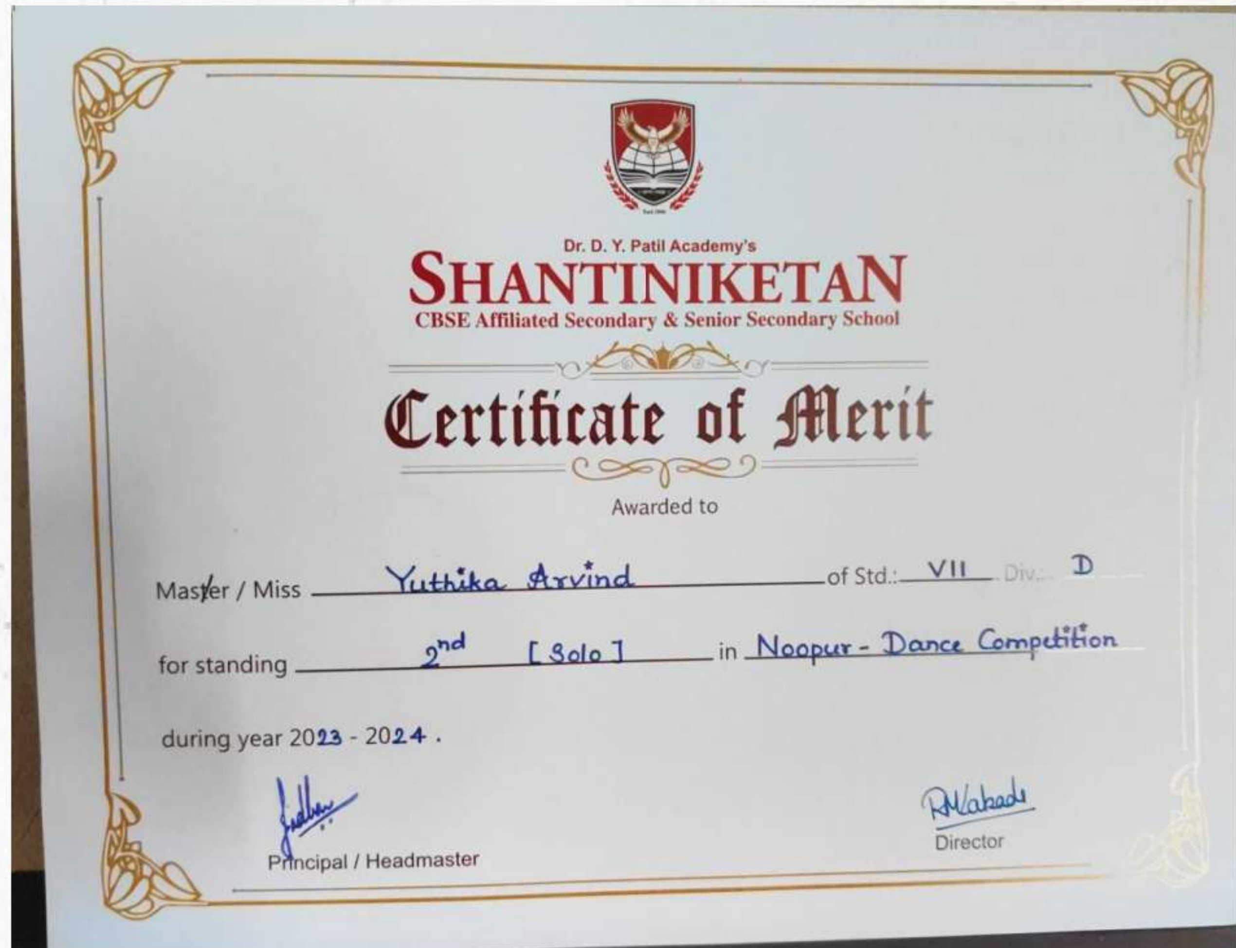
ROTAKID YUTHIKA ARVIND STOOD 2ND IN NOOPUR - DANCE COMPETITION AT SHANTINIKETAN SCHOOL